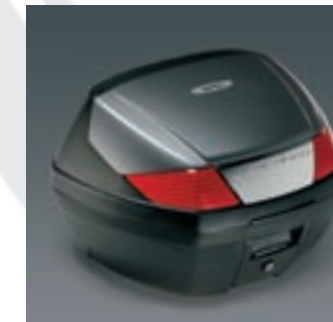
35 Litre top box Detachable 35 litre top box with lid in matching paint finish and chrome plated fixtures in perfect Scarabeo style.