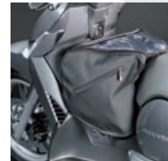
Tunnel bag 50 litre tunnel bag with a clear top map pocket and ample carrying capacity for even the longest journeys.