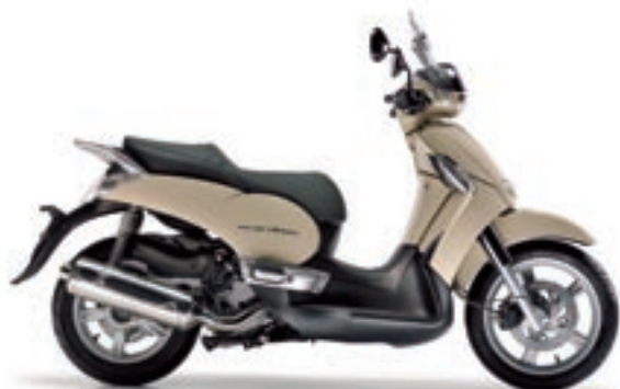
BEIGE PEARLY SAND