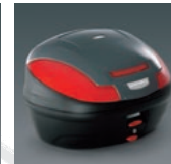
47 litre top box Detachable 47 litre top box with lid in matching paint finish, big enough to hold two open face helmets.