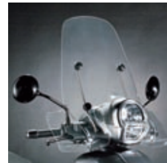
Windshield High windshield with handguards and chrome plated brackets, innovatively designed as a perfect match for Scarabeo.

Whatever your needs, the wide Scarabeo range has the right model for you.